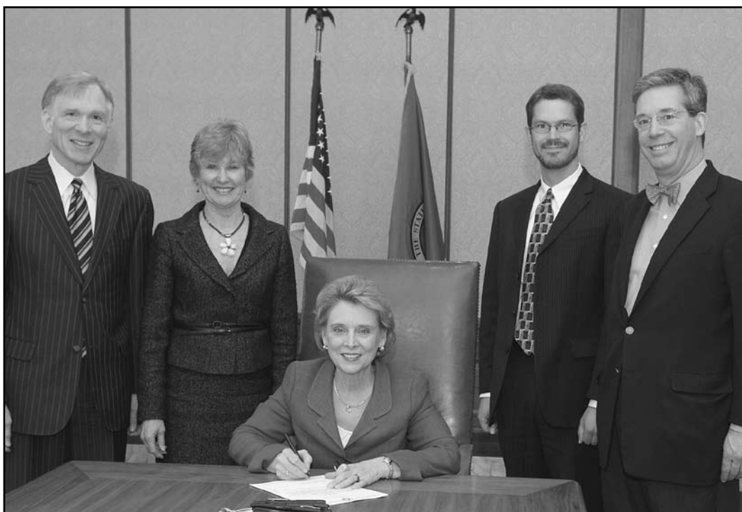
Gov. Gregoire signed Senate Bill 6831 into law on March 10, making Washington the first state in the nation to adopt this important estate tax law protection.