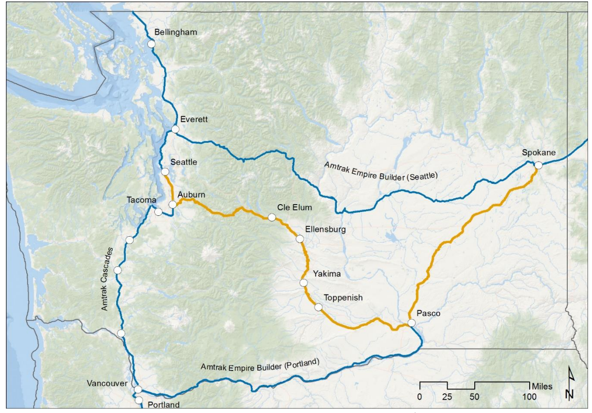
The rail corridor in gold, linking Seattle to Spokane, was the subject of this study.

The Stampede Pass corridor links Auburn in the Seattle metropolitan area to the Tri-Cities. The Stampede Pass line then connects with the Pasco East main line which continues northeast to Spokane. BNSF Railway owns the Stampede Pass line, which is currently used exclusively for freight rail transportation. For more than 90 years passenger trains did serve the Stampede Pass corridor but that ended in 1981. Since that time, there has been interest among the communities along the corridor and among other stakeholders in restoring passenger train service. Since 2001, several studies have examined restoring passenger service.